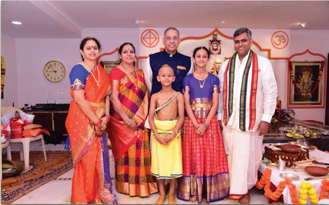
Grandson's Upanayanam Radhamadhavam - 2019