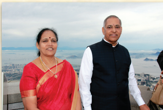
Rio de Janeiro, Brazil - 2015