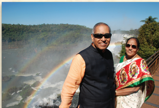
Iguazu Falls, Argentina - 2015