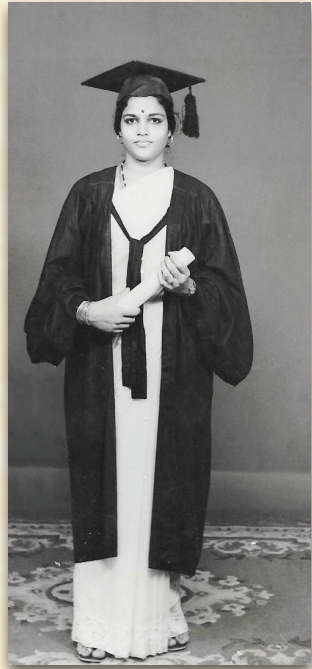
Graduation Ceremony 1972

In the mundane life, she successfully completed all her education in Hyderabad, from St. Francis educational institutions. She graduated in Public Administration and Political Sciences. Being Christian Missionary Educational Institutions, both her school and college had an in-house church, which she used to visit regularly. Though she was from a traditional orthodox Hindu family, her deep sense of devotion used to lead her to church. She also developed devotion towards Jesus the Christ. She gradually grew over the limitation of religion while she was treading the path of devotion.