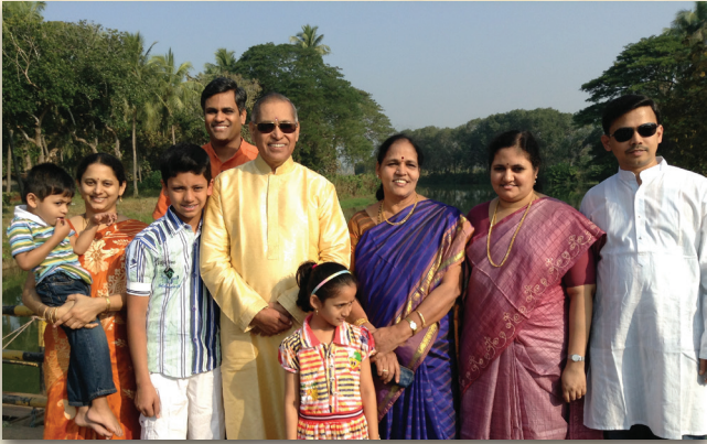
Konaseema, India - 2014