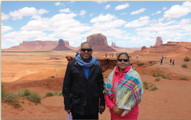
Master couple at Monument Valley - 2019 65 th Tour - her last international tour