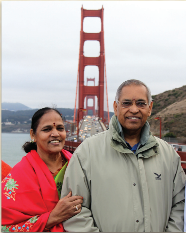
Golden Gate, USA - 2014