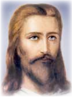
Master Koot Hoomi - Devâpi Maharshi -