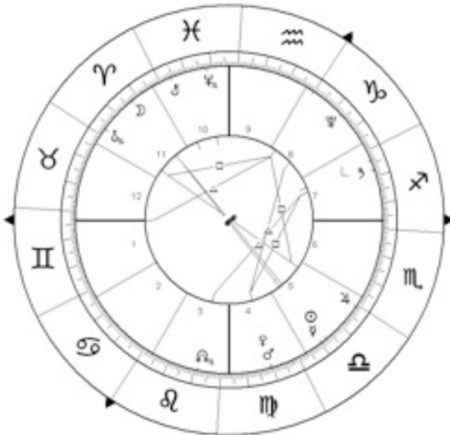
Full Moon of Libra, 05th of October, 2017, 20.40

BLISS IS IN GIVING AND NOT TAKING. SUN GIVES LIFE. HE IS MAN. MOON RECEIVES. SHE IS WOMAN. MOON HAS PHASES OF WAXING AND WANING.