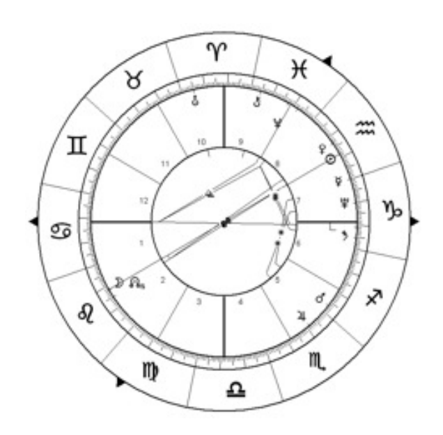
Full Moon of Aquarius, 31st January 2018, 14.26