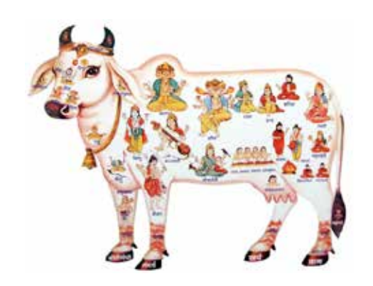
Cow The Symbol and its Significance

The Earth gets inspired by the presence of the seven sacred ones. They are the Cow, Master of Wisdom, Scriptures, Donors, Sacrificers and the Truth speakers.