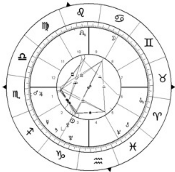
Full Moon of Capricorn, 2nd January 2018, 03.24

BLISS IS IN GIVING AND NOT TAKING. SUN GIVES LIFE. HE IS MAN. MOON RECEIVES. SHE IS WOMAN. MOON HAS PHASES OF WAXING AND WANING