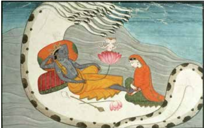
Vishnu and Lakshmi on the serpent Adishesha

The modern generations cannot comprehend an iota of the stature of Asuramaya and much less the stature of Narada.