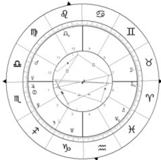
Full Moon of Scorpio, 4th November 2017, 06.23

BLISS IS IN GIVING AND NOT TAKING. SUN GIVES LIFE. HE IS MAN. MOON RECEIVES. SHE IS WOMAN. MOON HAS PHASES OF WAXING AND WANING